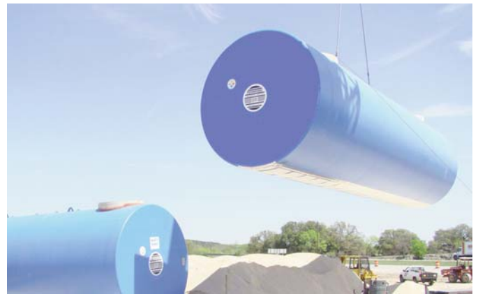
Compatible With a Wide Range of Fuels and Chemicals, Including Biodiesel and Ethanol

PROTECT THE ENVIRONMENT. BUY RECYCLABLE STEEL TANKS.