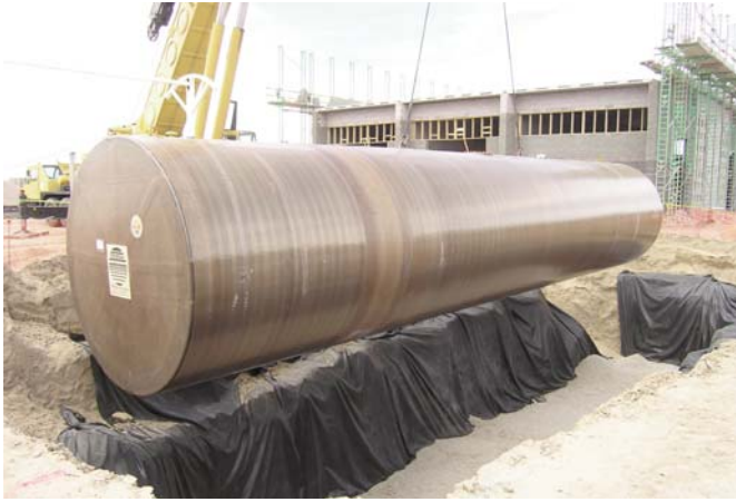
Meets EPA Leak Detection Requirements for Underground Storage Tanks

PERMATANK® double-wall jacketed underground storage tank features an inner steel tank coupled with an exterior corrosion-resistant fiberglass tank. A unique standoff material separating the inner and outer tanks creates a uniform interstitial space ensuring rapid and accurate leak detection.