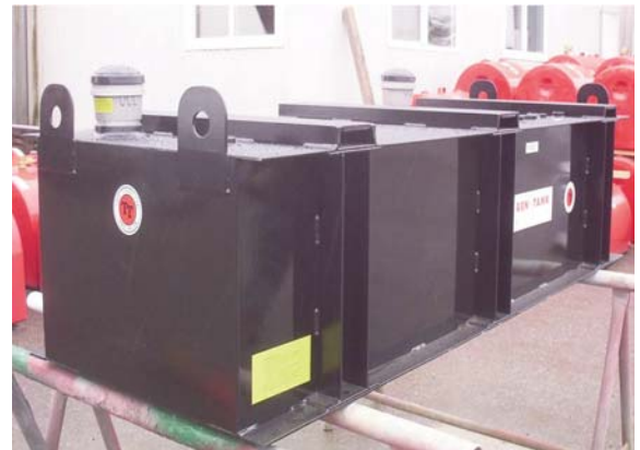
Compatible with a wide range of fuels and chemicals, including conventional diesel and biodiesel