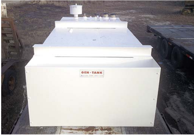
Low profile design enables structural support for the generator mounting

GEN-TANK Generator Base Tank provides sturdy support for your backup or emergency power generator. The low profile of the GEN-TANK design serves as the structural support for the generator mounting, while providing storage for a complete supply of generator diesel fuel.