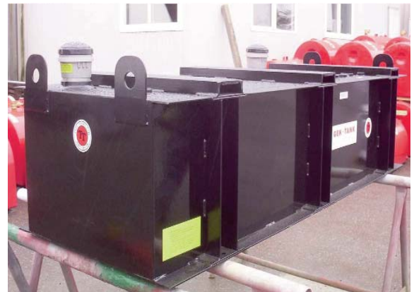
Compatible with a wide range of fuels and chemicals, including conventional diesel and biodiesel