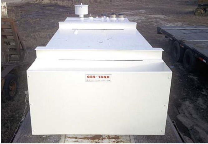
Low profile design enables structural support for the generator mounting

GEN-TANK Generator Base Tank provides sturdy support for your backup or emergency power generator. The low profile of the GEN-TANK design serves as the structural support for the generator mounting, while providing storage for a complete supply of generator diesel fuel.