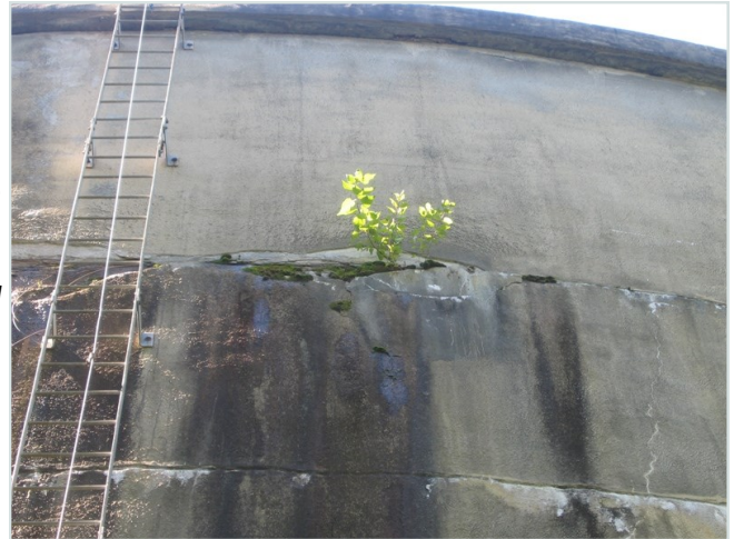
Many states require water storage tanks to be impervious. However, AWWA standards for concrete tanks have an allowable leakage rate as constructed. That means tank construction specifications must contain special instructions to be in compliance with those state regulations.

The bolted seams in bolted steel tanks are required to be made watertight with gasket materials to provide a leak-proof seal. Although many of the joints may require sealant to be made leak-proof, application or re-application of sealant at regular intervals will not eliminate the need to maintain the